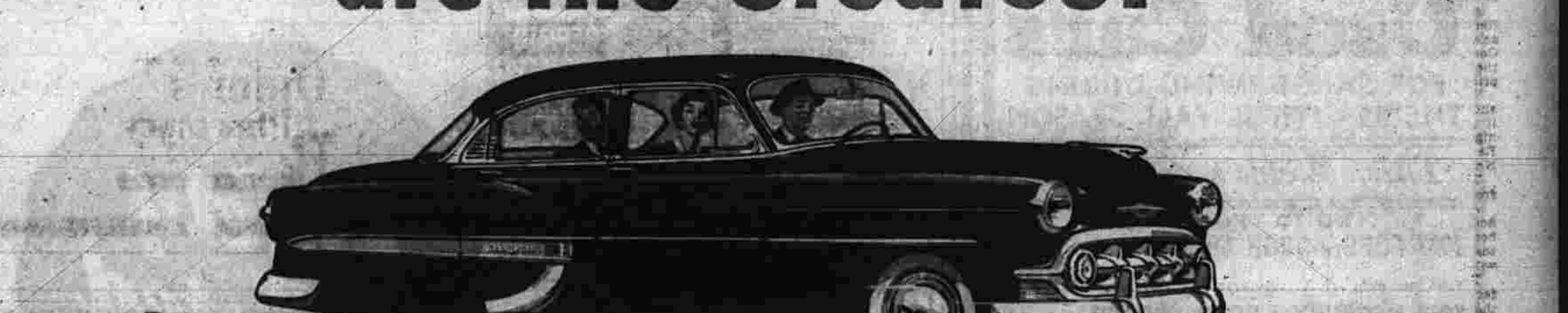
Chevrolet's striking Bel Air 4-door sedan. With 3 great new series, Chevrolet offers the widest choice of models in its field.

Here's something to think about before buying any car... CHEVROLET ADVANTAGES are the Greatest